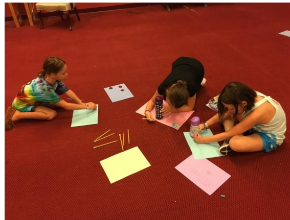
Learning the art of Set Design

Please fill out the registration forms through: